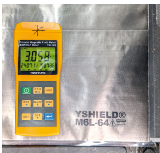
YSHIELD® TM-192 / Battery with shielding

YSHIELD GmbH & Co. KG 94099 Ruhstorf, Germany www.yshield.com info@yshield.de