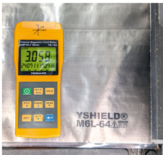
YSHIELD® TM-192 / Battery with shielding

Compact and easy-to-use measuring device for measuring alternating magnetic fields ELF. Surprisingly accurate despite the low price compared to professional measuring technology from Narda, Gigahertz, Fauser, etc.