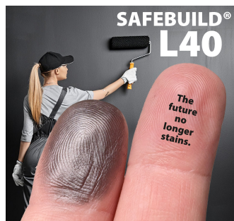
YSHIELD® SHIELDING PAINTS

YSHIELD GmbH & Co. KG 94099 Ruhstorf, Germany www.yshield.com info@yshield.de