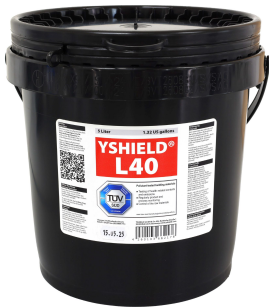
YSHIELD® SAFEBUILD® L40

Universal shielding paint for room and building shielding and for technical applications. No more staining! Up to 90 dB at 40 GHz. TÜV-SÜD certified.